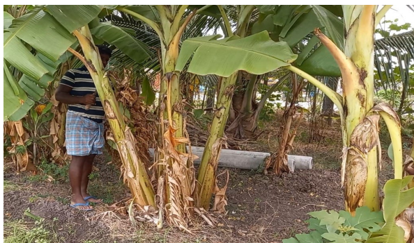
Figure-03: Waste of Banana Plant.

nutrients such as potassium, phosphorus, and calcium, banana plant waste serves as an excellent addition to vermicomposting bins. Its fibrous nature contributes to the structural integrity of the compost pile, facilitating proper aeration and moisture retention. Moreover, the diverse array of organic matter present in banana plant waste fosters microbial activity, crucial for the decomposition of organic materials into nutrient-rich compost. To optimize its decomposition, chopping or shredding the waste into smaller pieces is advisable, allowing for easier consumption by composting worms. Alternating layers of banana plant waste with other organic materials like kitchen scraps or shredded paper promotes a balanced carbon-to-nitrogen ratio, essential for efficient decomposition. Regular monitoring of moisture levels and temperature ensures an ideal environment for worm activity and decomposition. By integrating banana plant waste into vermicomposting practices, individuals can harness its nutritive value, recycle organic material, and produce compost that enhances soil fertility and supports robust plant growth.