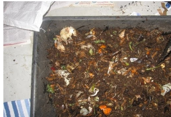
Figure-04: Vegetable waste.

Vegetable waste is a highly valuable component in vermicomposting due to its rich organic content and nutrient composition. When incorporated into vermicomposting bins, vegetable waste provides essential food sources for composting worms, such as Eisenia fetida , aiding in their growth and reproduction. Additionally, vegetable waste contains a diverse array of nutrients, including nitrogen, phosphorus, and potassium, which are gradually released during decomposition, enriching the resulting vermicompost with valuable plant nutrients. This nutrient-rich compost serves as an excellent organic fertilizer, promoting soil health and supporting robust plant growth. Moreover, vegetable waste helps maintain proper moisture levels within the vermicomposting system, creating an optimal environment for microbial activity and decomposition. By diverting vegetable waste from landfills and integrating it into vermicomposting practices, individuals can effectively recycle organic material, reduce waste, and produce high-quality compost for use in gardening and agriculture.