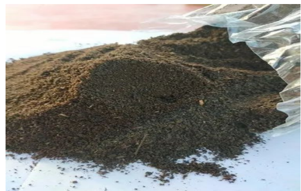
Figure-02: Cow Dung

Using cow dung in vermicomposting is a common practice and can be highly beneficial for the process. Cow dung is rich in organic matter and essential nutrients, making it an excellent addition to vermicomposting bins. When properly utilized, cow dung helps in balancing the carbon and nitrogen ratio in the compost, providing food for the worms, and aiding in the decomposition process. Additionally, cow dung introduces beneficial microorganisms that contribute to the breakdown of organic matter and the creation of nutrient-rich vermicompost. However, it's essential to use well-aged cow dung to avoid any potential issues with pathogens or unwanted seeds. Properly layering cow dung with other organic materials and monitoring the moisture levels and temperature in the vermicomposting bin are crucial for ensuring optimal conditions for worm activity and decomposition. By incorporating cow dung into vermicomposting, you can produce high-quality compost that enriches the soil and promotes healthy plant growth.