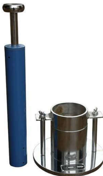
Fig. 2: Modified Proctor test apparatus

The graphical relationship of the dry density to wet content is then aforesaid considering the values found to ascertain the compaction curve. The determined curve comes in parabolic form and dry density worth is increasing up to a most limit and at that time once more the worth reduced. the utmost dry density is finally obtained from the height purpose of the compaction curve and its corresponding wet content, that is thought because the optimum wet content (OMC). Used formulas square measure listed below.