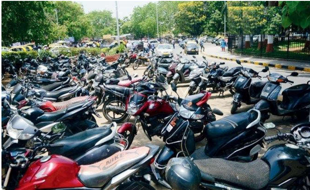
Figure 5: MDU Rohtak Parking site