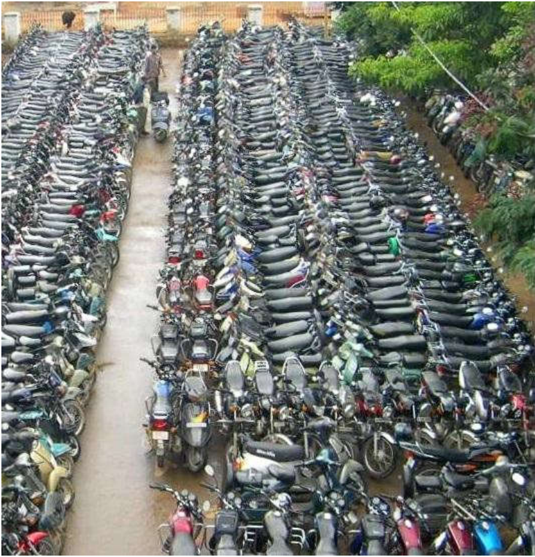
Figure 2: Rohtak Railway Station Parking site in day time