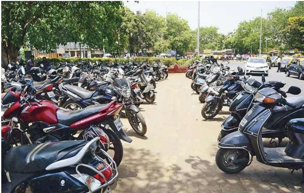
Figure 6: PGIMS Rohtak Parking site