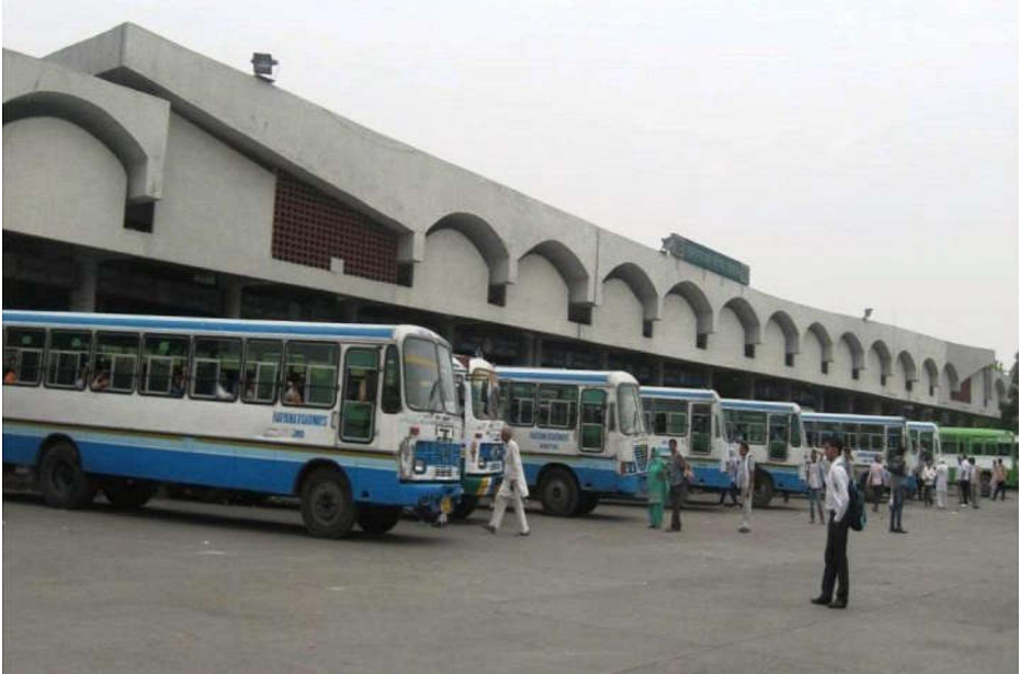
Figure 3: Rohtak New Bus Stand Parking site for buses