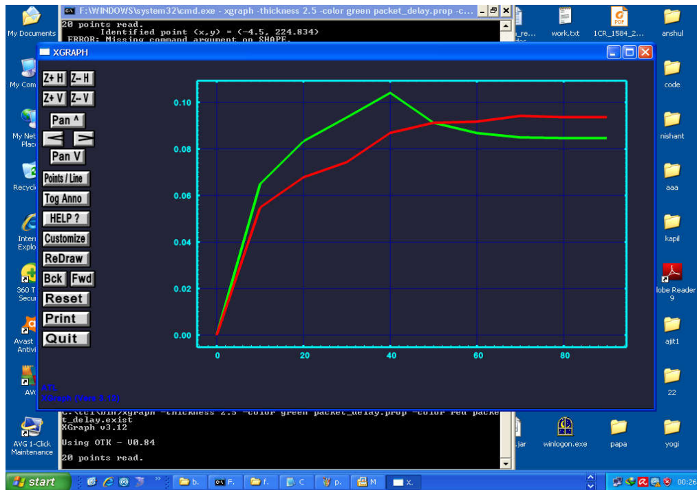
Figure 4: Packet Delay Analysis

Here figure 3 is showing the packet loss analysis over the network in case of existing and proposed work. Figure shows that the packet loss in case of proposed work is much lesser than existing work. In this figure, x axis represents the simulation time and y axis shows the packet communication loss.