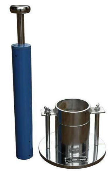
Fig. 2: Modified Proctor test apparatus

The graphical relationship of the dry density to wet content is then aforethought considering the values found to ascertain the compaction curve. The determined curve comes in parabolic form and dry density worth is increasing up to a most limit and at that time once more the worth reduced, the utmost dry density is finally obtained from the height purpose of the compaction curve and its corresponding wet content, that is thought because the optimum wet content (OMC). Used formulas square measure listed below.