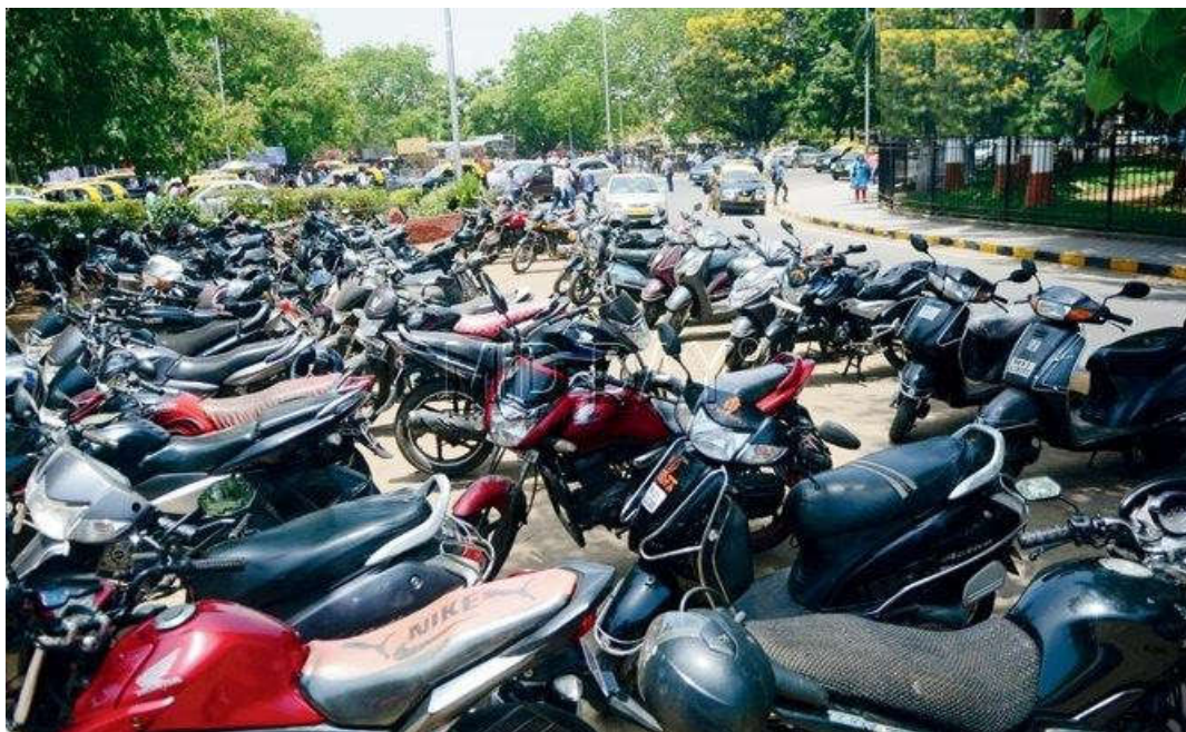
Figure 5: MDU Rohtak Parking site