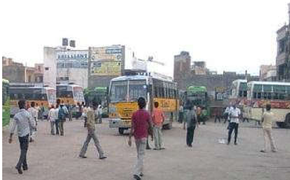
Figure 4: Rohtak Old Bus Stand Parking site for buses