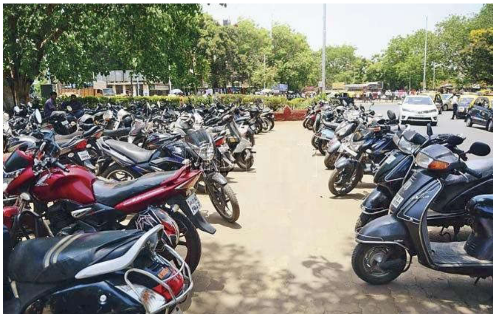
Figure 6: PGIMS Rohtak Parking site