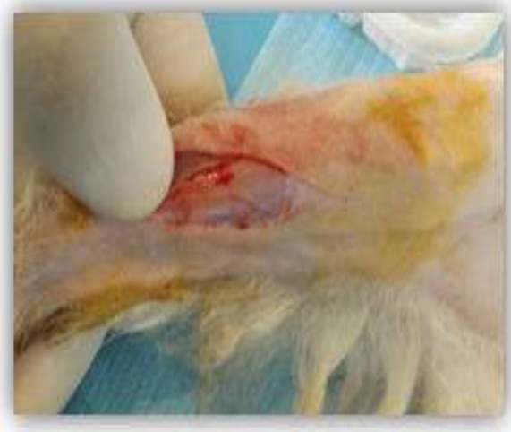
Figure (1) An incision parallel to longitudinal axis of the tibia

A thirty sterile Orthodontic micro-implants(Dentos, AbsoAnchor, SH1312-5/ tapered type, South Korea), made of Ti-6Al-4V alloy, with a diameter of 1.3mm and 5mm length were used. At the time of the surgery, each experimental animal was premeditated using intramuscular injection of 0.2 ml/kg B.W. of Ketamine 10% (anesthetic solution) and 0.025ml/kg B.W. of Xylazine 2% (muscle relaxant drug), the medial surface of the right tibia anaesthetized by 1ml of local anesthetic solution 2% Xylocaine, after shaving the site, the exposed skin disinfected using 10% Povidone Iodine. An incision of approximately 35 mm in length (Figure 1), in the dorsal aspect of the tibia, down in the skin parallel to the longitudinal axis of the tibia, dissecting the fascia and the periosteum was stripped and elevated denuding the medial aspect of the tibia bone (Figure 2).