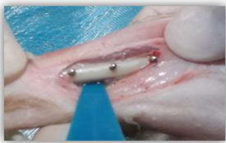
Figure (4) Three Orthodontic Micro-Implants in Place

The micro-implants were inserted by special handdriver, the longaxis of the micro-implant was kept perpendicular to the external cortical tibia as possible (Figure 4).