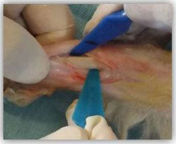
Figure (2) Rabbit's Tibia Bone

Three small holes (Figure 3) approximately 10 mm apart (with a 1 mm rounded head drill) were done using implant surgical engine (Surgic XT – NSK/ U.K), the rotational speed was 1100rpm, "FWD-<" clockwise rotation", and a torque of 35newton/cm.