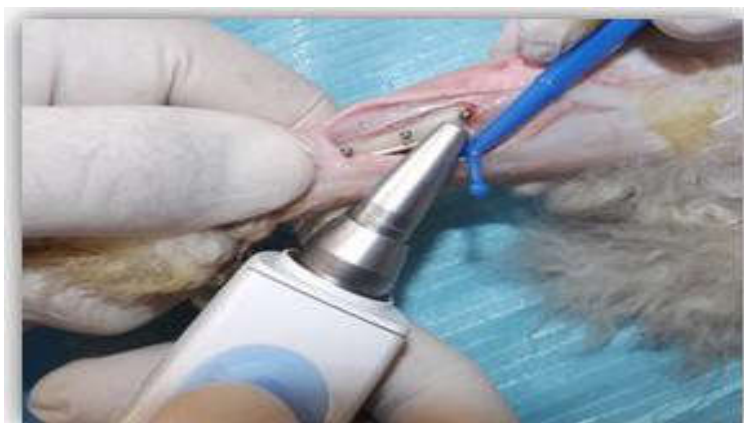
Figure (5) Primary Stability Reading

The primary stability then tested using Periotest Mdevice (Medizintechnik Gulden – Germany), the Periotest M device held horizontally with the starting bottom up, the tip of the hand piece was kept at a distance about 2-3 mm from the micro-implant head, and perpendicular to the micro-implant head as possible. Three readings for each micro-implant were taken, and the mean for such three readings were taken as a final reading (Figure 5).