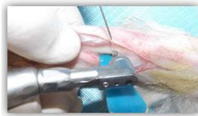
Figure (3) A small hole preparation

The micro-implants were inserted by special handdriver, the longaxis of the micro-implant was kept perpendicular to the external cortical tibia as possible (Figure 4).